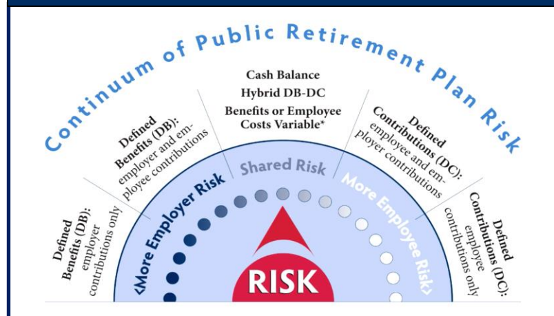
Figure 1: Continuum of Public Retirement Plan Risk

The degree to which risk is shared between employees and employers varies across differing plan designs. The term hybrid generally refers to plans that combine elements of both defined benefit and defined contribution plans to generate participants' benefit upon retirement. The most recognized hybrid plan designs are cash balance plans and defined benefit-defined contribution (DB-DC) combination plans, and these plan designs are the focus of this brief.